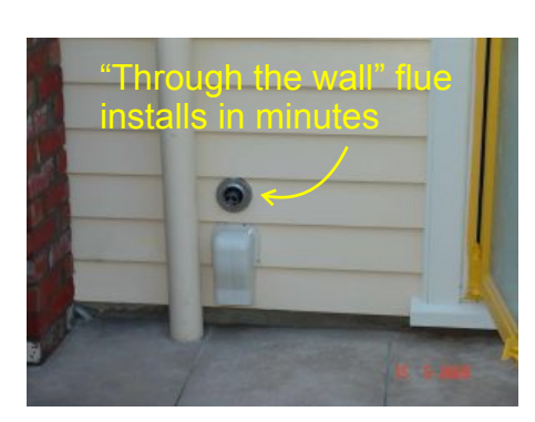
NO TALL FLUE REQUIRED